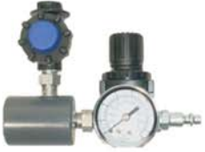
BGA - Pneumatic adapter with regulator P/N BGA