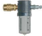
Filter - air and water filter ready to use P/N F35121- 400