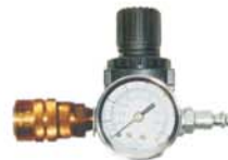
Custom Multi-Pump Single Adapter with Regulator - 1 required per system P/N BGA-MPS-C-R