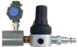
BGA-3psig - Pneumatic adapter with 3psig limiter P/N BGA-3psig