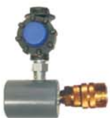
Specialty Pump Adapter for Custom Multi-Pump - 1 required per custom multi-pump P/N BGA-MSPA-C