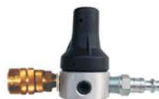
Custom Multi-Pump Single Adapter with 3PSIG Limiter 1 required per system P/N BGA-MPS-C-3P